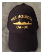
Blue Ball Cap

Blue Ball Cap ("USS Houston CA-30", 10 oz.) $15.00 Brown Ball Cap ("USS Houston CA-30", 10 oz.) $5.00 Brown & Black Ball Cap ("U.S.S. Houston CA-30 2 nd Generation", 10 oz.) $5.00