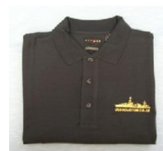
Men's Polo Shirt

Note Cards of the USS Houston Ship (pack of 10) (5 oz.) $10.00