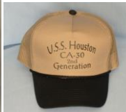
Brown & Black Ball Cap