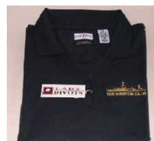
Women's Polo Shirt